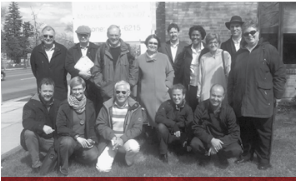
Representatives in leadership positions of Little Brothers chapters located in France, Germany, Switzerland, Ireland, Poland, Spain, Canada and the U.S. visited our Minneapolis office in April.